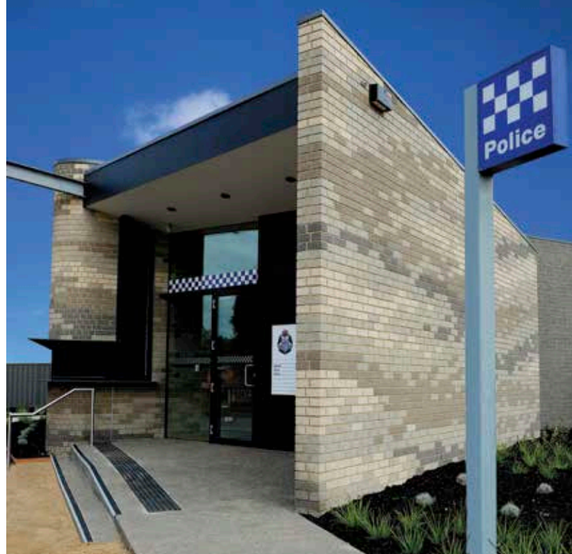
The Axdale Police Station used 15,000 of Adbri Masonry's Coloured Architectural Bricks in both honed and shotblast finishes.

To request your own brick sample pack call 1300 365 565 or email us at enquiries@adbrimasonry.com.au