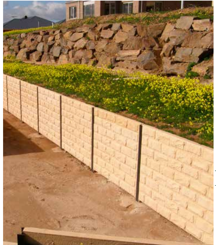
Concrete Sleepers | Bedrock Sandstone